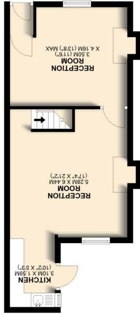
GROUND FLOOR APPROX. 50.5 SQ. METRES (543.3 SQ. FEET)